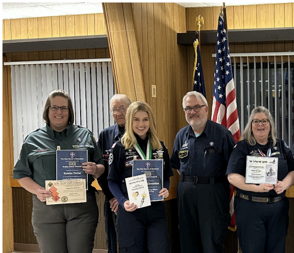
Adults receiving awards at the Taughannock District Recognition event

This April has been spent by Ship 25 doing things they can be proud of. Members of Ship 25 this April worked advancement, community-related affairs, and then attended the Taughannock District Recognition event where Scouts and Scouters received numerous awards and recognition for their work.