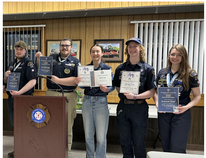
Other adults and youth receiving awards at the Taughannock District Recognition Event